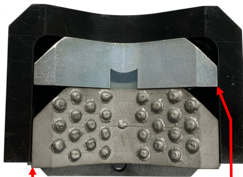
EPIROC® OEM Jaw

425 Manufacturing is an Aftermarket Parts Manufacturer and not affiliated with or authorized by EPIROC®. Our parts are manufactured in our facility in Rockford, IL USA