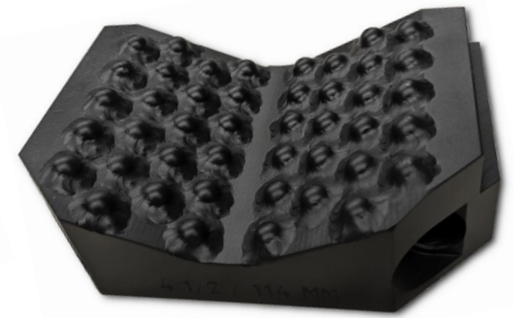
4-1/2" Drill Pipe Combination Jaw