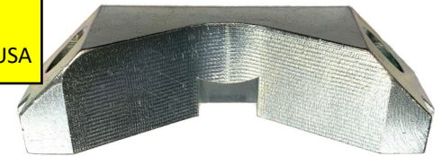
EPIROC® P/N 3222 3113 62 Spacer

Solid 1 Piece Construction No Wasted Gripping Area