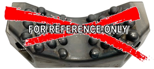
2nd Generation EPIROC® Jaw