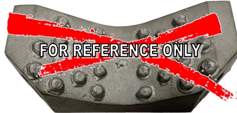
1st Generation EPIROC® Jaw