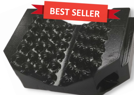
3-1/2" - 4" Drill Pipe Combination Jaw