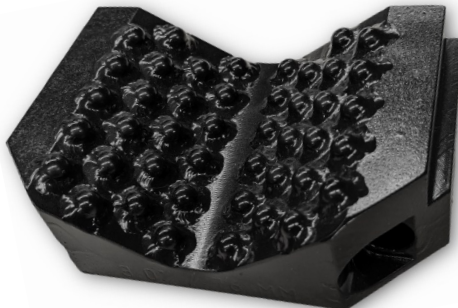
3" - 76MM Drill Pipe Combination Jaw

With EPIROC®, one size MUST fit all. The only size jaw EPIROC® offers is designed around the most popular pipe size. This jaw fits evenly between the 3-1/2" and 4" drill pipe sizes. This is also, by far, our best selling jaw size. ( Our 425 P/N 1889 ) Our customers have requested that we give them more variety. 425 Manufacturing is proud to say that we have now designed jaws specifically to fit 3" diameter and 4-1/2" diameter pipe. Let for 425 Mfg. give you more options, three to be exact.